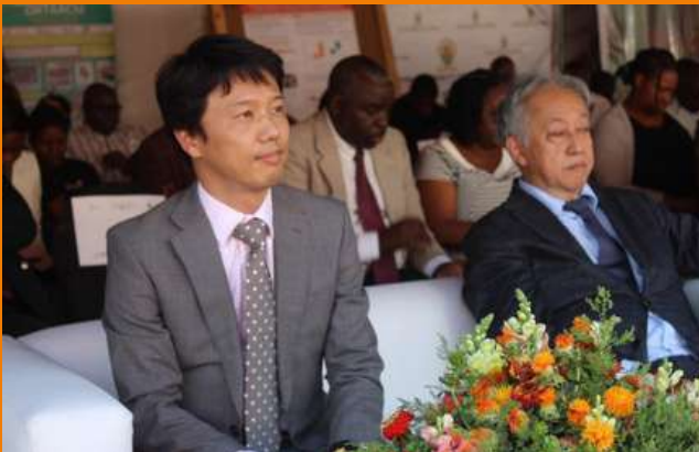
Japanese Ambassador to Zambia and JICA representative