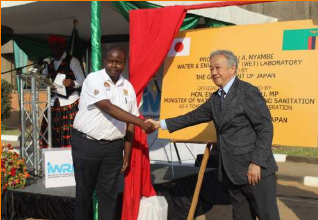
Japanese Ambassador to Zambia and Ministry of Water and Sanitation Representative