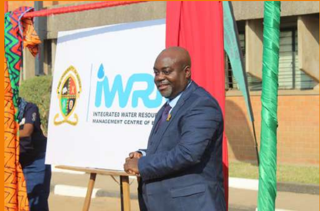
UNZA Deputy Vice Chancellor - Research and Innovation